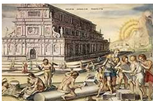
Temple of Artemis at Ephesus