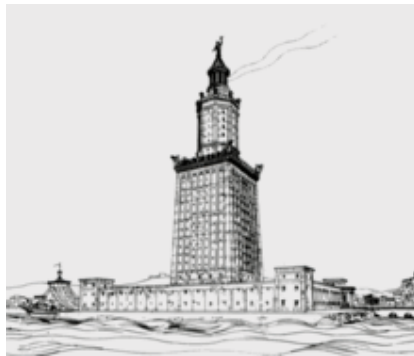
Lighthouse of Alexandria