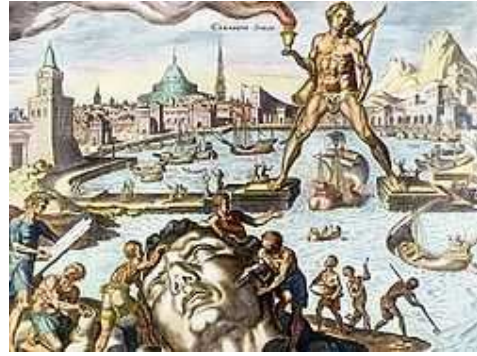
Colossus of Rhodes