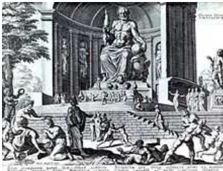
Statue of Zeus at Olympia