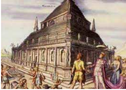
Mausoleum at Halicarnassus