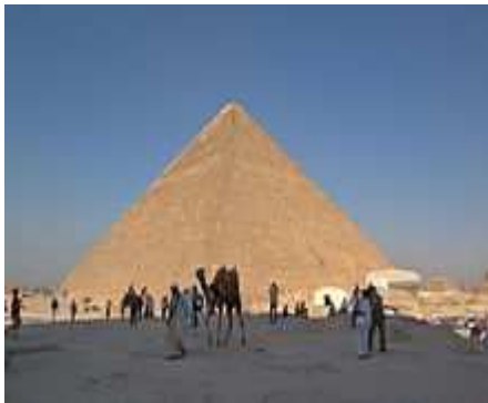
Great Pyramid of Giza

Today, the only ancient world wonder that still exists is the Great Pyramid of Giza.