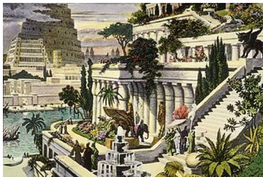
Hanging Gardens of Babylon