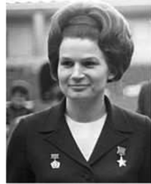
Laika, the first dog in space Yuri Gagarin, the first person in space Valentina Tereshkova, the first Woman cosmonaut